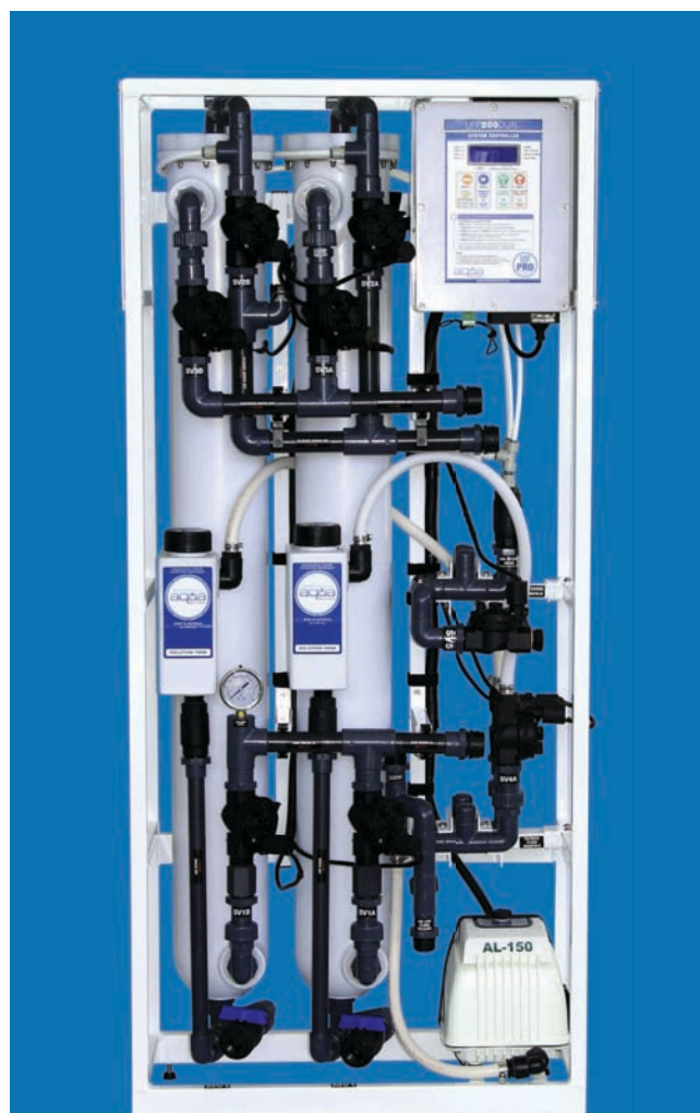
UFPRO200DUAL - 2 Module Unit

The membrane filtration modules use MEMCOR® high permeability, low fouling PVDF hollow fibre membranes for optimum performance and long life. Our modules are simple in design and easy to install and maintain. Thousands of membrane plants globally rely on MEMCOR® membrane modules for their water filtration requirements.